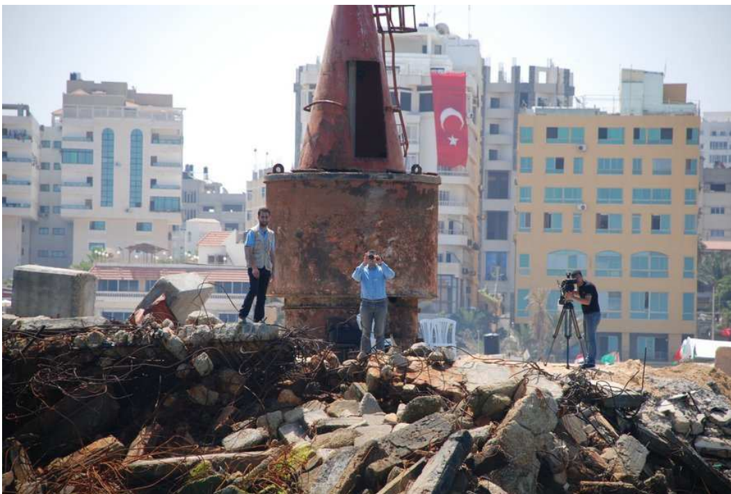
In Gaza City, people waiting for the flotilla before receiving news that it had been intercepted by Israeli forces on 31 May.

While the full details of the situation remain unclear, nine civilians were reportedly killed and many others injured. Goods carried by the flotilla reportedly included cement, generators, wheelchairs, medicine, clothes, blankets, and toys.